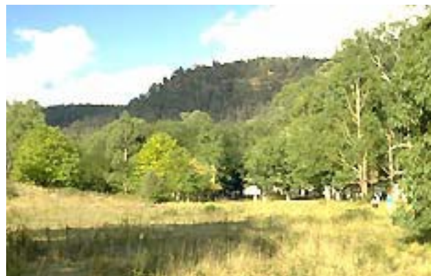
Main street of the Joadja Township