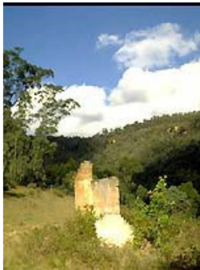
House remains at Joadja