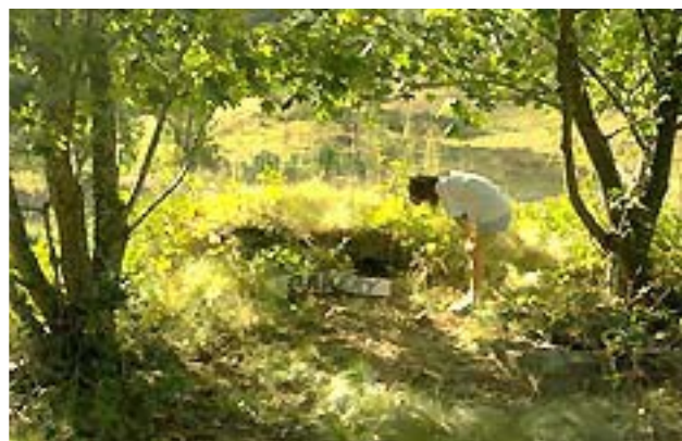
Remains of Joadja Bakery

Since our work there, the township has acquired a new owner and become a tourist attraction. Usually this means it costs money to visit. However, the owner is aware of our work there and has offered us a FREE tour. The site is in the hills to the